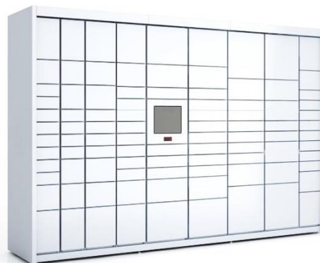
Parcel terminal indoor