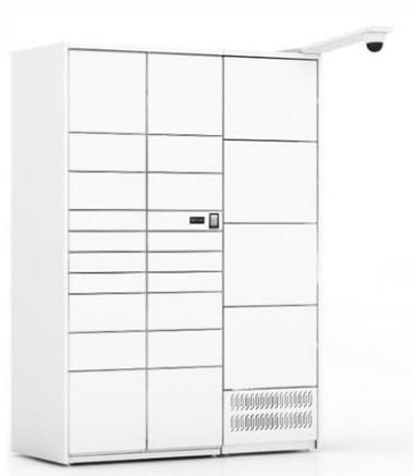
Parcel terminal «FreshBox»